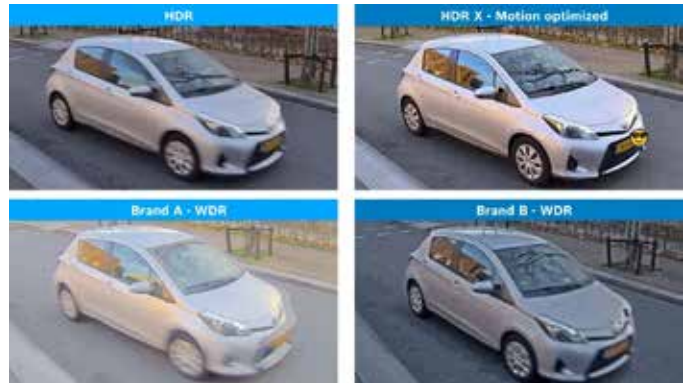
HDR X eliminates motion blur and artefacts in scenes with challenging lighting and fast-moving objects