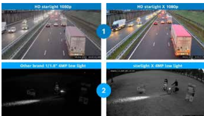
[1] Low light comparison of starlight to starlight X in 1080p resolution