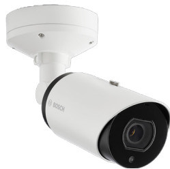
DINION INTEOX 7100i IR ITS