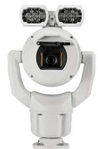
MIC INTEOX 7100i ITS

With highly accurate automatic incident detection and rich vehicle and VRU data aggregation, deep neural network-based video analytics tailored for ITS accelerate the drive toward smarter, safer, and more sustainable transportation ecosystems. For more information, contact intelligent.transportation@us.bosch.com