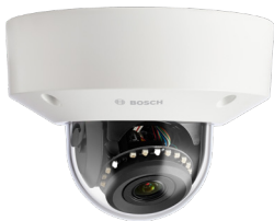
FLEXIDOME INTEOX 7100i IR ITS

and keys needed for authentication and encryption. The Bosch Remote Portal serves as the gateway to the cloud-based Bosch ITS Data Service. Connecting to the Bosch Cloud and Remote Portal is secure. Connectivity is initiated by the camera using an end-to-end certificate-based encrypted path. Once a secure connection is established, the camera can be licensed to push its data stream to the Bosch ITS Data Service. Cloud-based event recording and real-time push notifications about important events can also be licensed for a complete solution.