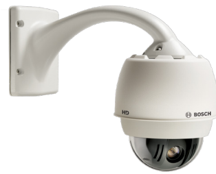
AUTODOME INTEOX 7000i ITS